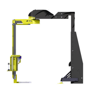
The rotating arm can be easily adjusted to achieve a wrapping diagonal of 78" or 87"; offering extreme versatility at no additional cost.

Four individual wrap programs can be stored using the touch screen HMI for simple operation of the machine. The programs include eight functions which can be adjusted to meet the demands of the most challenging applications.