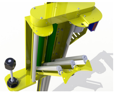
The power pre-stretch carriage offers optimal load containment and minimal film usage. It also allows for easy film threading.